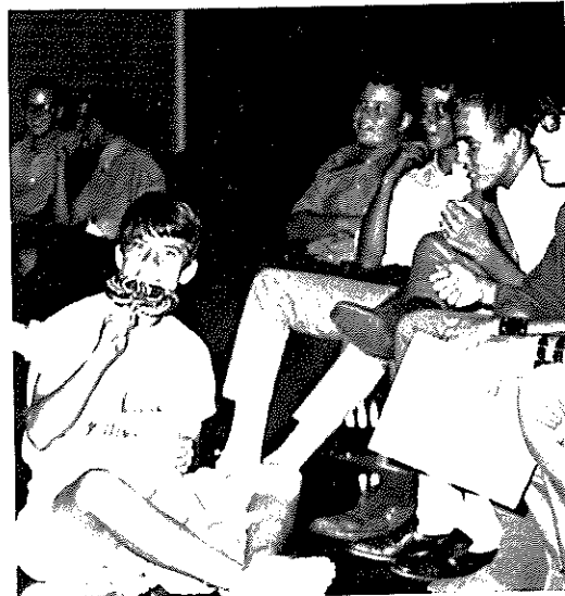
These look like spooks!