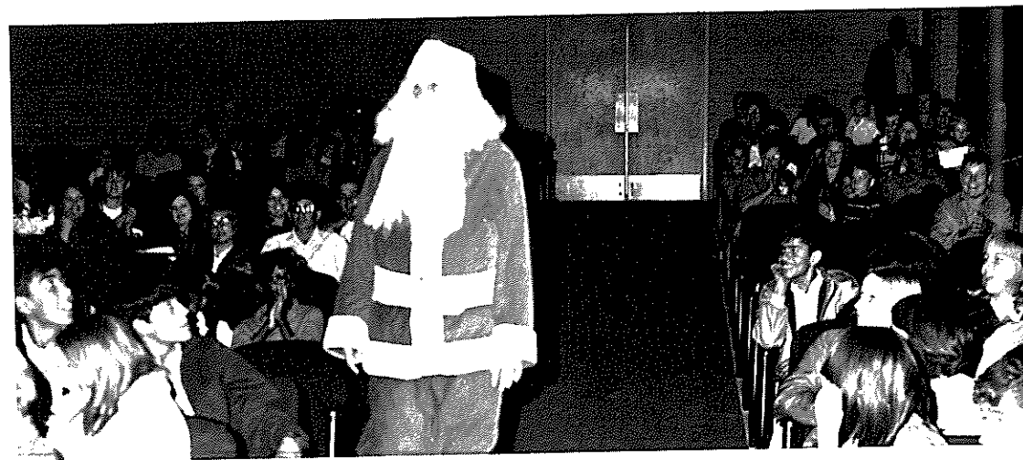
Santa Claus has come to town.