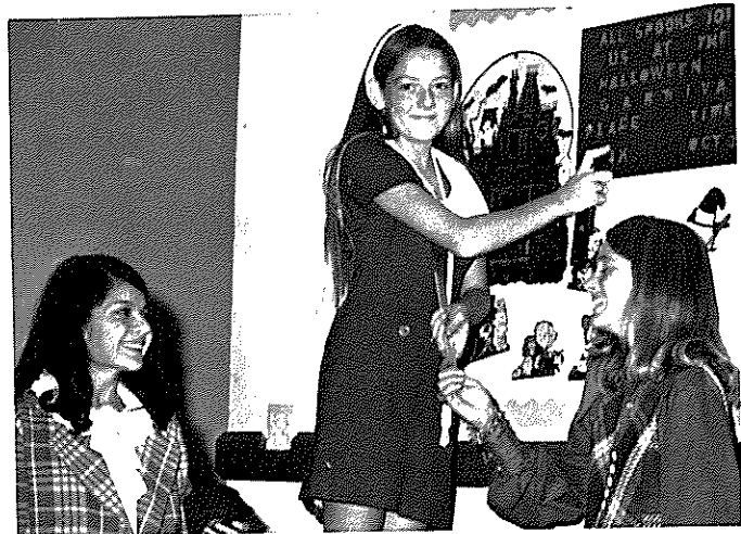
No spooks here!

The Student Council sponsors many activities that benefit and add spice to the school year. After a rousing campaign and election, they had dances after football games, ran a booth at the Halloween Carnival, decorated the halls and bulletin board, sold fish on slave day, arranged a patriotic program and a Christmas program, supervised the crowning of Homecoming and School Queens, held play nights, and sold popcorn balls.